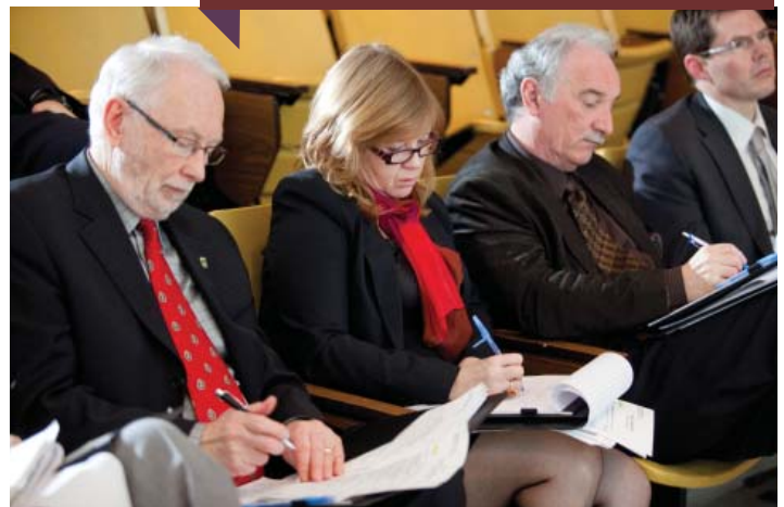
TEAM PRESENTATIONS AND JUDGING