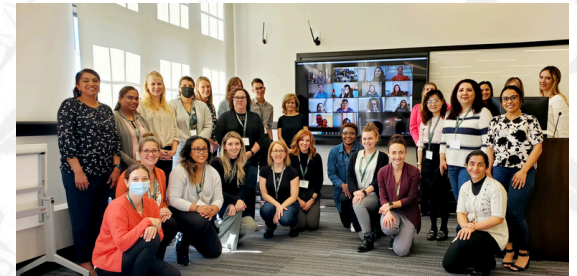
2022 Cohort of the MHA during the in-person residency