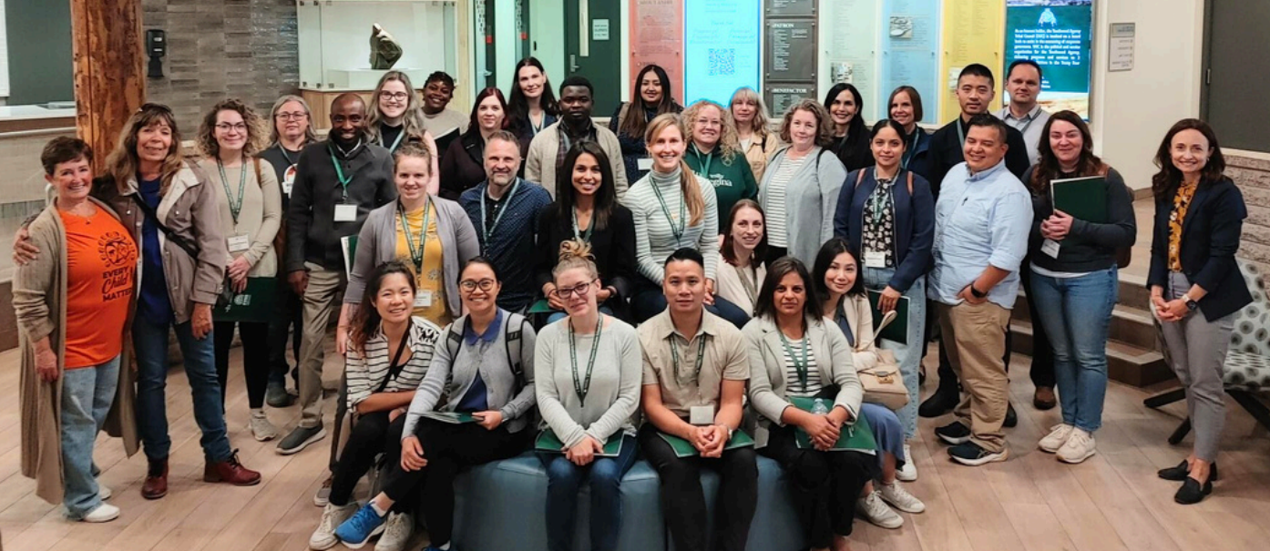
2025 Cohort of the Master of Health Administration (MHA) at the All Nations' Healing Hospital, Fort Qu'Appelle during the in-person residency