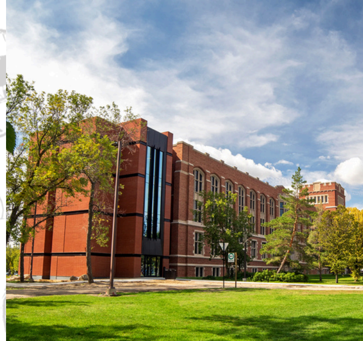
University of Regina College Avenue Campus, Treaty 4 Territory