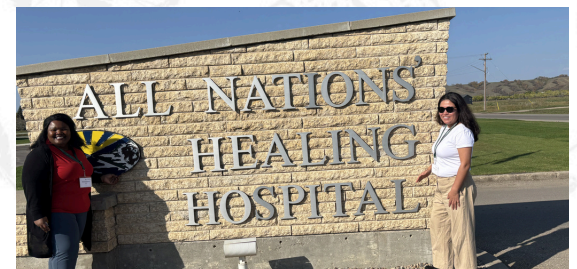
MHA students at the All Nations' Healing Hospital

Students can also begin their journey with our three-course Graduate Certificate in Health Systems Management, which ladders into the MHA.