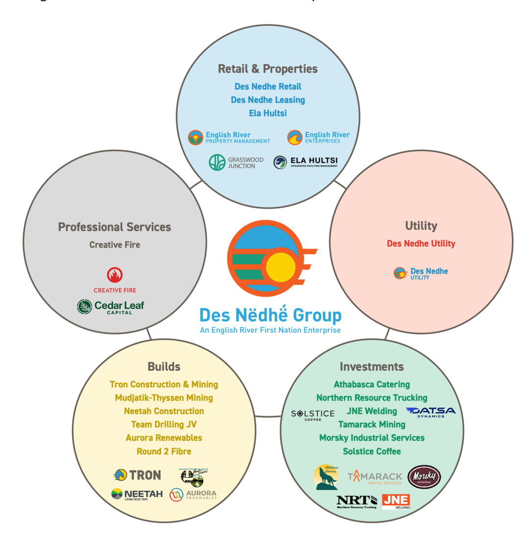
Figure 3. The Des Nedhe Group of Companies